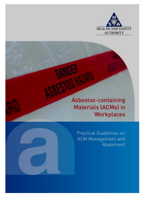
Practical Guidelines on ACM Management & Abatement